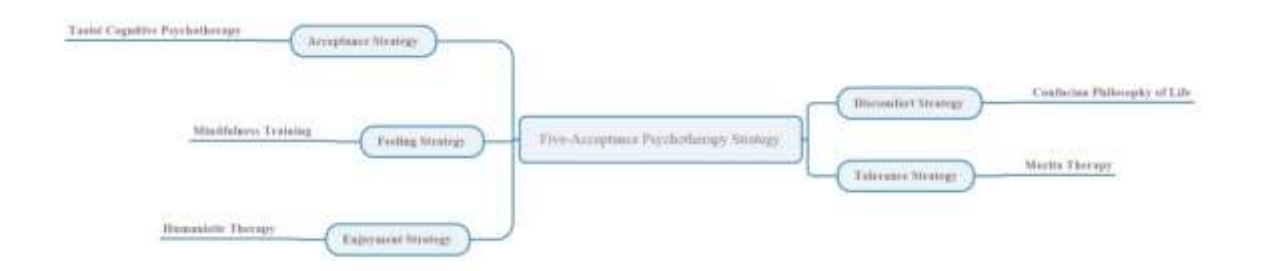
Fig 3: Five-acceptance psychotherapy strategy

As mentioned above, the domestic treatment of phobia at present still mainly adopts single psychotherapy or combined use with drugs. On the one hand, there is a lack of strong evidence-based research evidence for efficacy, and on the other hand, psychological therapies implanted from the West face problems such as cultural barriers. However, exploration into localization and integration of psychotherapy has already become the mainstream of international psychotherapy research [26,27]. As Nelson points out: "In the West, after the recognition of limitations in each psychotherapy, integration has become the dominant phenomenon in the recent evolution of psychotherapy." [28]. Scholar Song Huanxia et al. pointed out: "Localization is also a major theme in the field of domestic psychotherapy at this stage, and some scholars are attempting to create a psychotherapy integration system applicable to Chinese people". Therefore, how to adopt psychotherapy integration and localized thinking to exploratively construct psychotherapy strategy for phobia has become a necessary and important task.