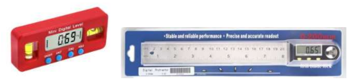
Fig 2:Structural diagram of inclinometer

Inclinometer (as shown in the figure) according to its working principle has a variety of service acceleration type, resistance strain gauge, etc., more commonly used for the service acceleration type. The structure of inclinometer is shown in Figure 2.