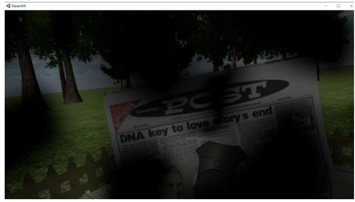
Fig 6: Picking under peripheral vision loss

Peripheral Vision loss. Taking picking under peripheral vision loss task as an example, the user simulates the one with peripheral vision loss as picking and reading a newspaper. The User is required to pick up the newspaper in 15 seconds. If the task fails, can select the reset button (See Fig. 6)