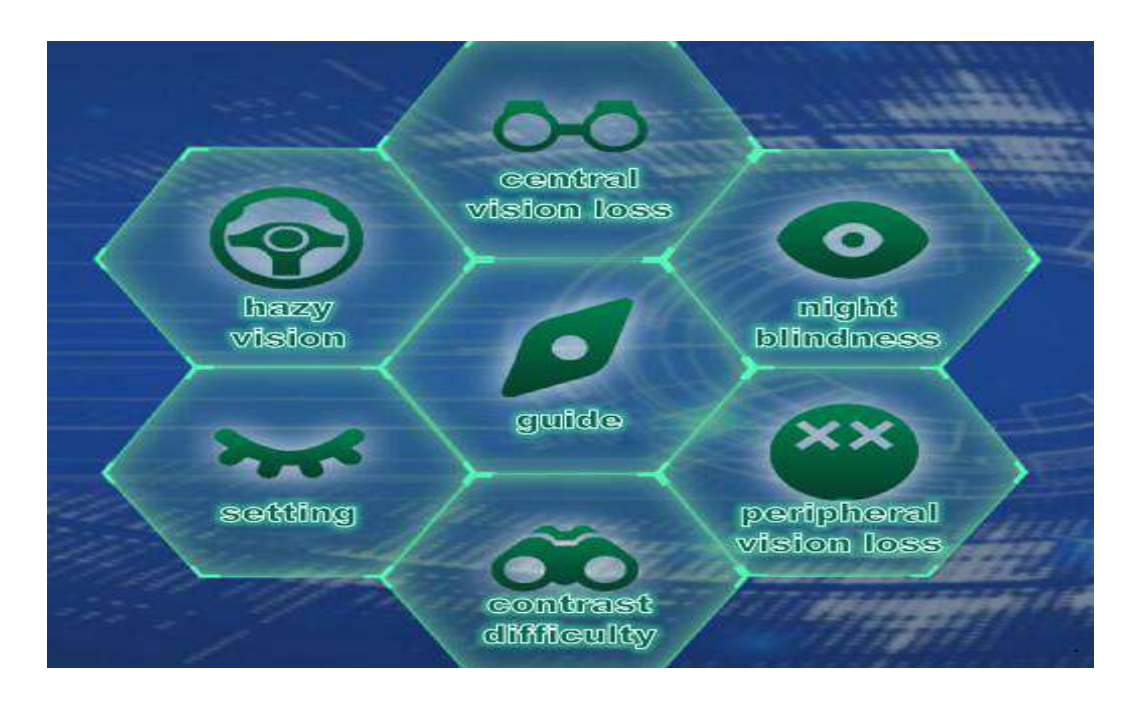
Fig 1: The main menu interface

Log in to the main menu, we can choose different simulation scenarios through the controller, and we can learn the operating rules of the application (See Fig. 1).