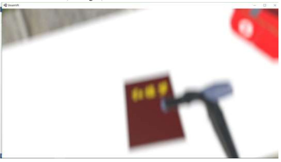
Fig 3: Writing under the hazy vision

Hazy Vision. Taking writing under the hazy vision task as an example, the user simulates the one with the hazy vision to be writing on the book. The task instructions are shown as text on the windows and explained by a voiceover. The User is required to write 3-5 words in the specified location. If the task fails, one can select the reset button (See Fig. 3).