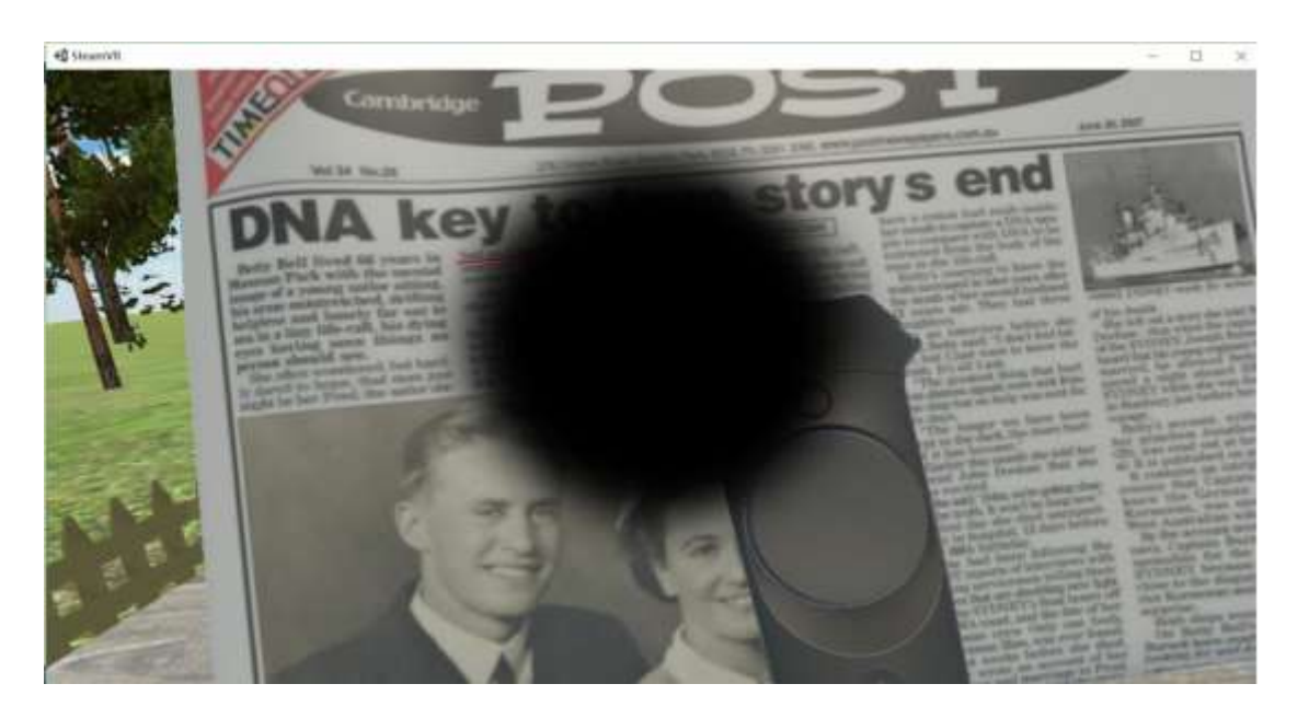
Fig 4: Reading under central vision loss

Central Vision loss. Taking reading under the central vision loss task as an example, the user simulates the one with central vision loss as reading a newspaper. There is always a black spot in the center of sight. The user would be asked to read out a sentence highlighted with an underline in the center of his visual field within no more than 1 minute, and the completion criteria of the task were hinted at mainly by voiceover (See Fig. 4).