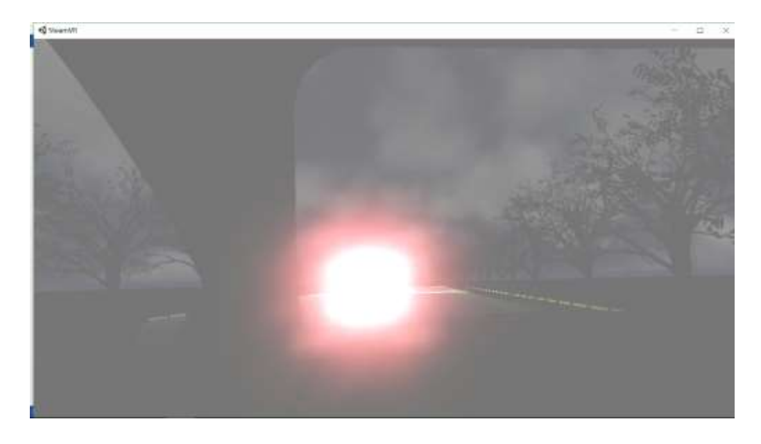
Fig 7: Car driving under contrast difficulty

the one with contrast difficulty is settled in a car, task instructions are shown as text on the windows and explained by a voiceover. Users with simulated contrast difficulty would be demanded to avoid oncoming cars with bright light, If the task fails, a scenario simulating a car accident would be shown (See Fig. 7).